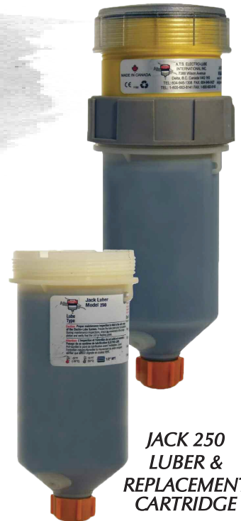
JACK 250 LUBER & REPLACEMENT CARTRIDGE