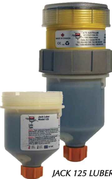
JACK 125 LUBER & REPLACEMENT CARTRIDGE