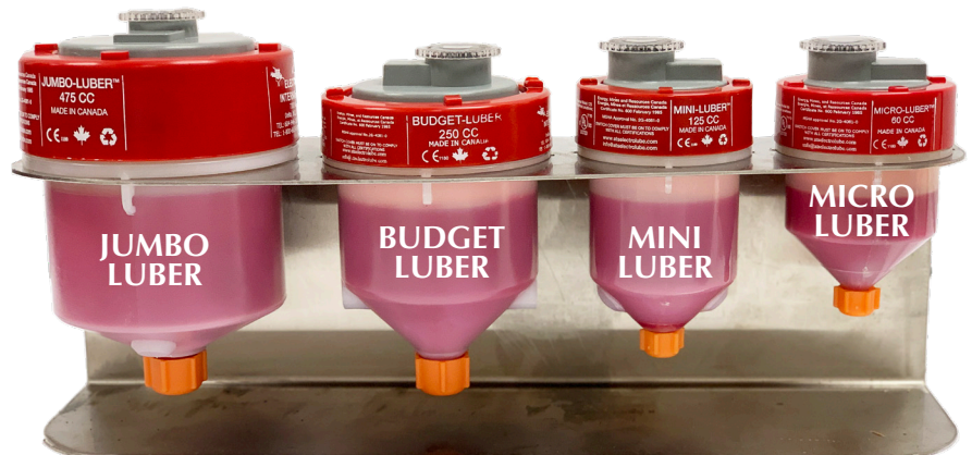
THE LUBERS PICTURED ABOVE ARE FILLED WITH STANDARD LUBRICANT